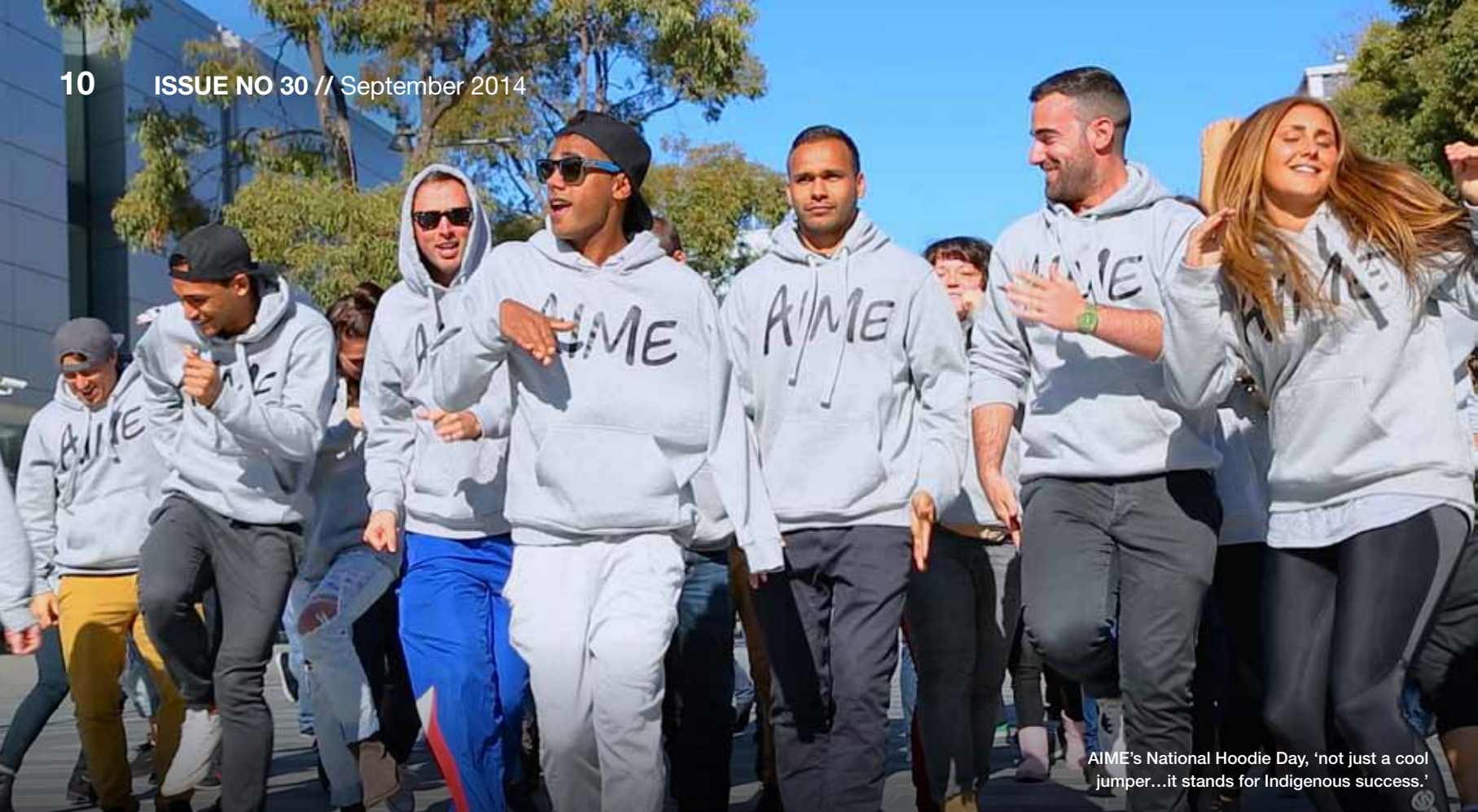
AIME's National Hoodie Day, 'not just a cool jumper...it stands for Indigenous success.'