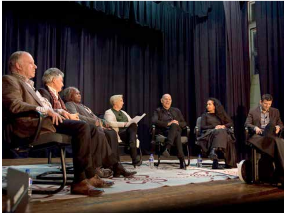
The Indigenous Art Code public forum.

The Indigenous Art Code aims to overcome these challenges, by ensuring fair trade with Indigenous artists. It establishes a set of industry standards, provides a benchmark for ethical behaviour and gives consumers greater certainty that the artworks they buy come through ethical processes.