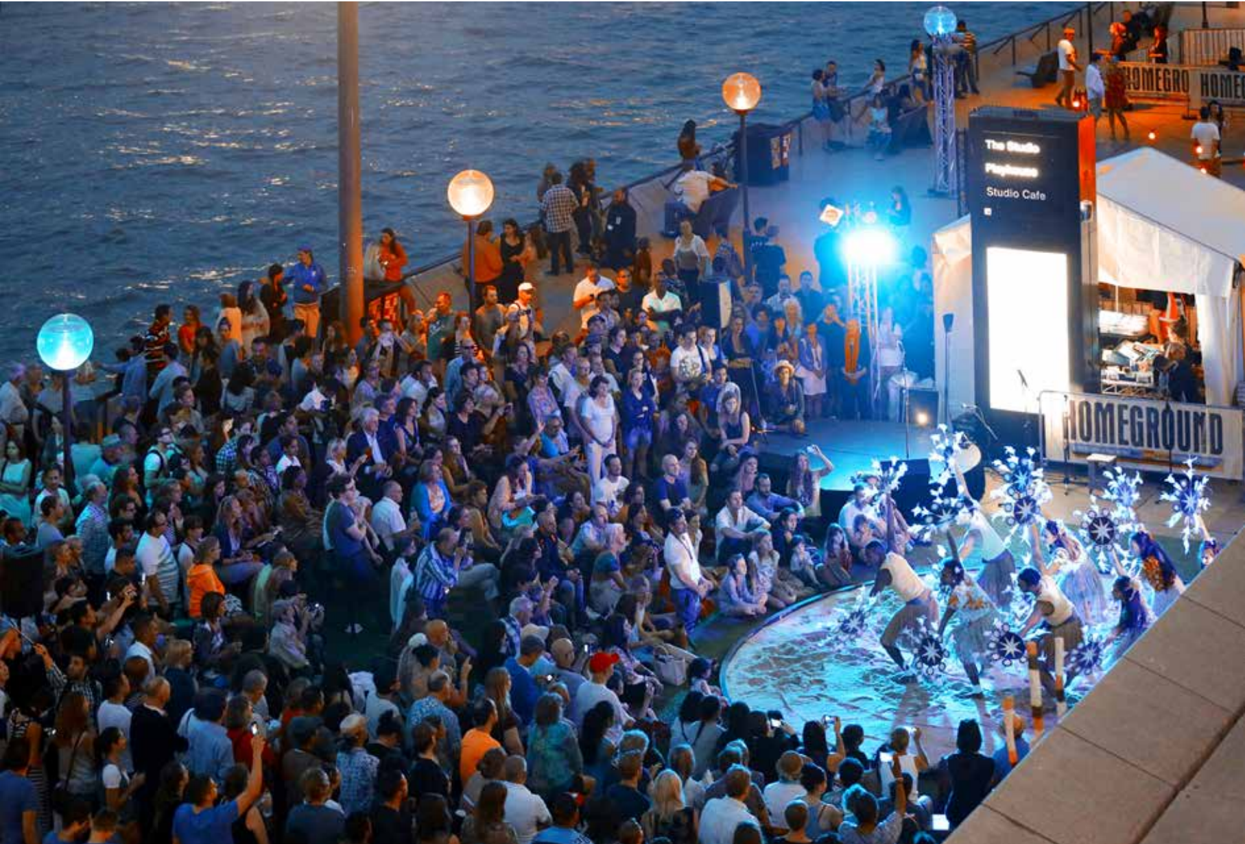
Homeground Festival 2014.

the Dance Rites competition. Each dance group participating in the competition will present three dances—a welcome and a farewell dance, which includes a chant in local language, and a third ‘wildcard’ dance of the group’s choosing. Registrations for the 2015 event closed in September with 10 groups, 160 participants in total, from across NSW, QLD and the Torres Strait Islands participating. All participants performed at Sydney Opera House’s Homeground festival on Sunday 22 November with the winner receiving a $15,000 prize and the opportunity to perform at the following year’s festival.