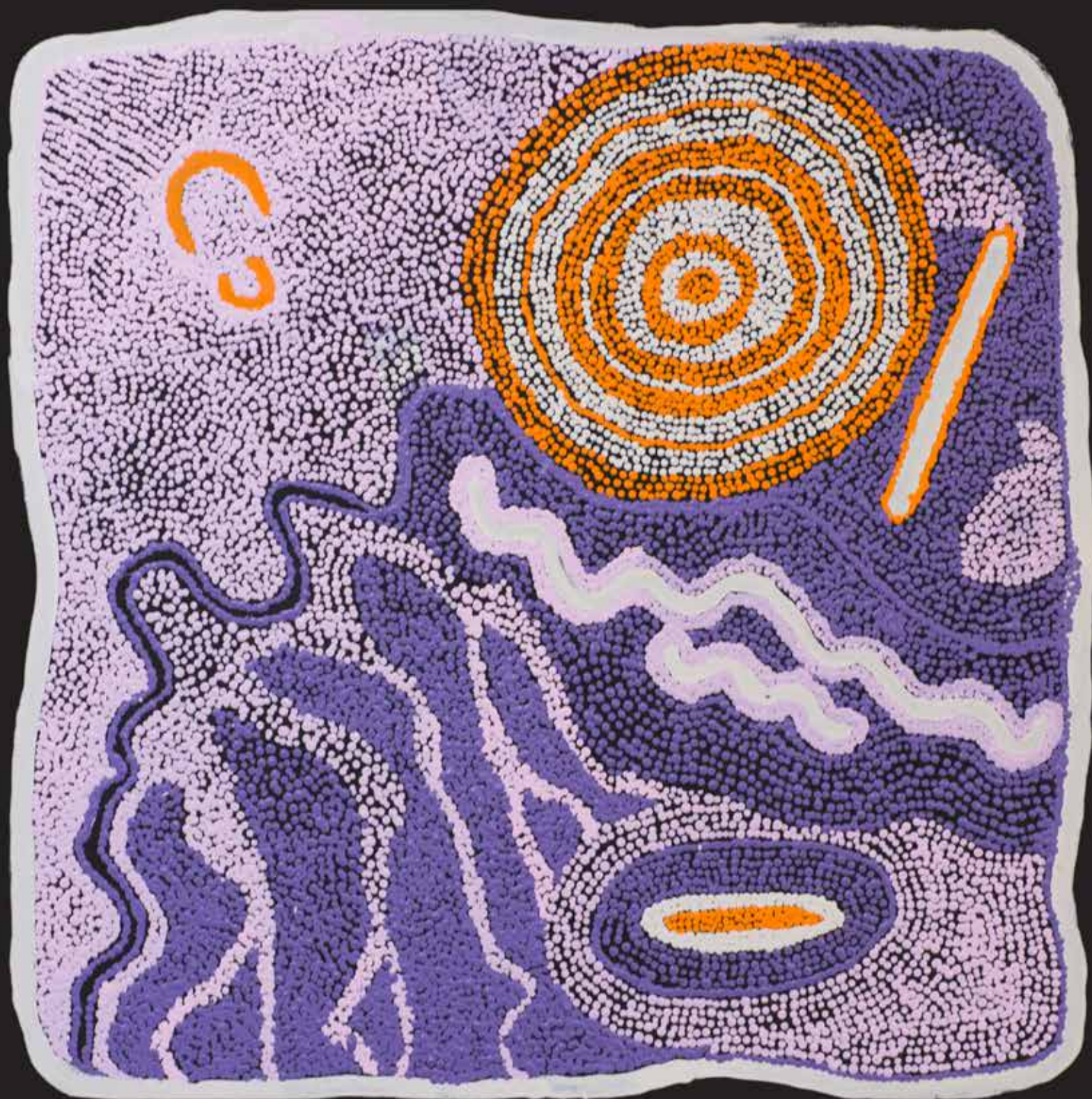
Lizzie Ellis Minyma Tjukurla 75.5 x 75.5cm acrylic on canvas.