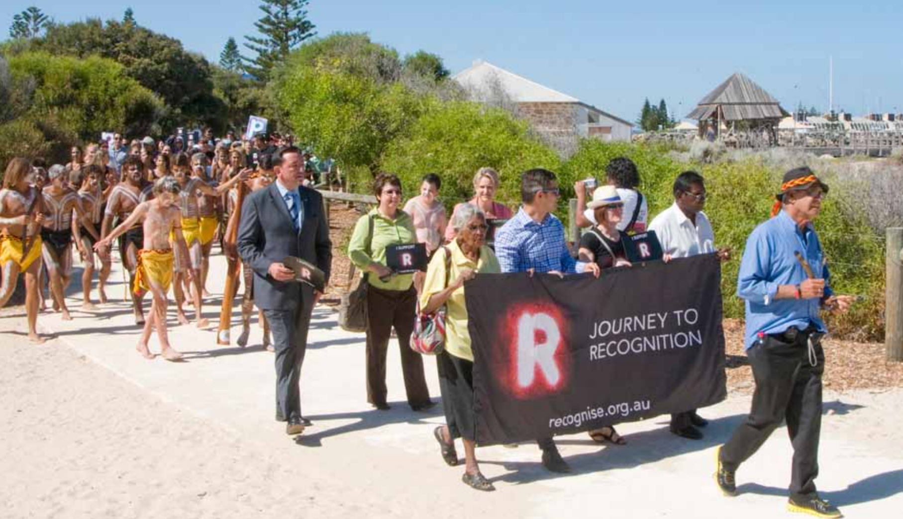
The Journey to Recognition kicked off in Fremantle on March 10 led by Whadjuk Noongar elders.

The latest leg of the Journey to Recognition took in South West Western Australia, stopping in small towns and regional centres and building support along the way.