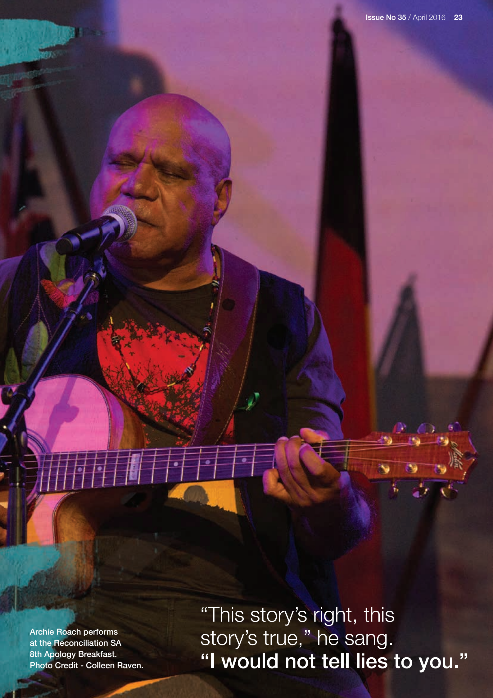
Archie Roach performs at the Reconciliation SA 8th Apology Breakfast.

“This story’s right, this story’s true,” he sang. “I would not tell lies to you.”