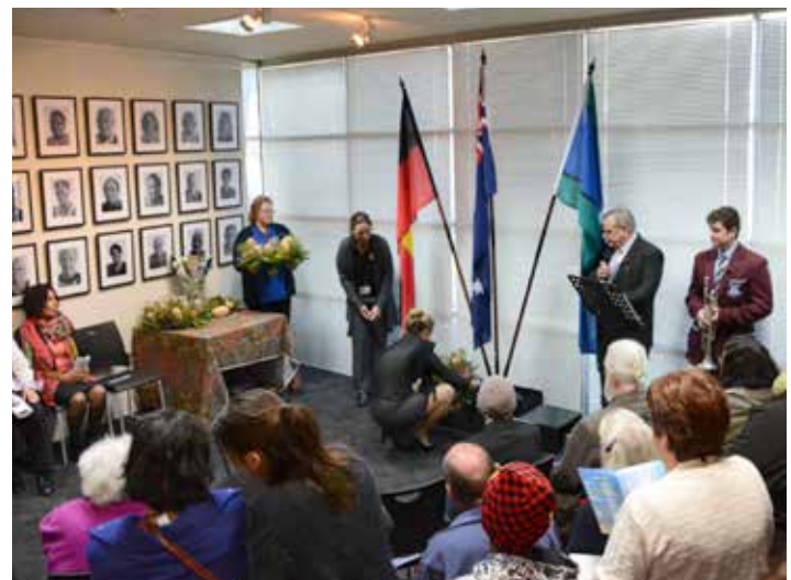
Redland City Council NAIDOC Week ceremony.