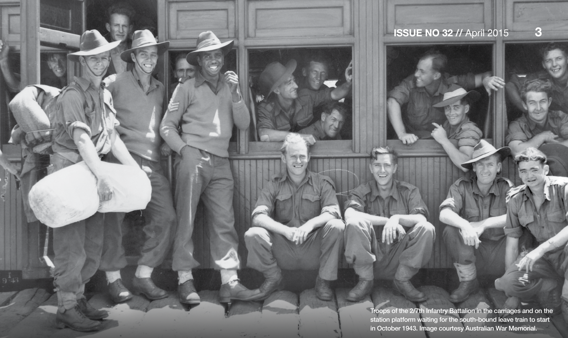
Troops of the 2/7th Infantry Battalion in the carriages and on the station platform waiting for the south-bound leave train to start in October 1943.