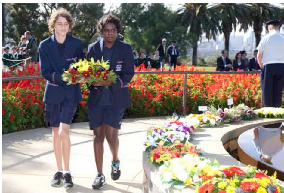
School students laying a wreath during the Perth National Reconciliation Week ceremony.