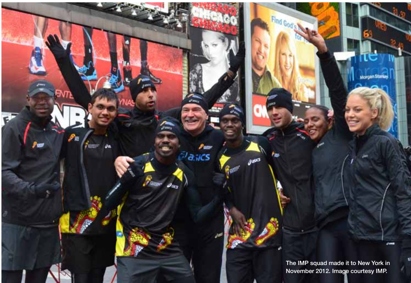
The IMP squad made it to New York in November 2012.

"I want Australia to be a better place where Aboriginal and Torres Strait Islander peoples can feel proud."