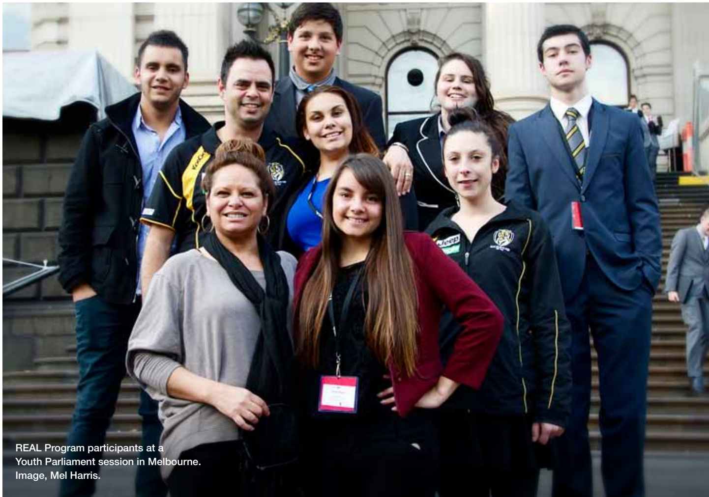
REAL Program participants at a Youth Parliament session in Melbourne.